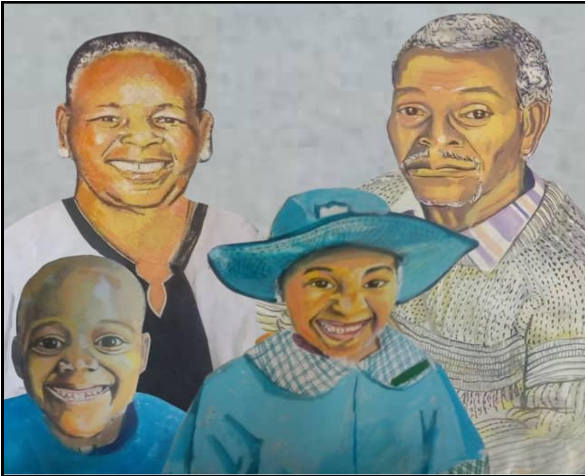
Agogo(a akazi), agogo aamuna ndi zidzukuru Grandmother, grandfather and grandchildren