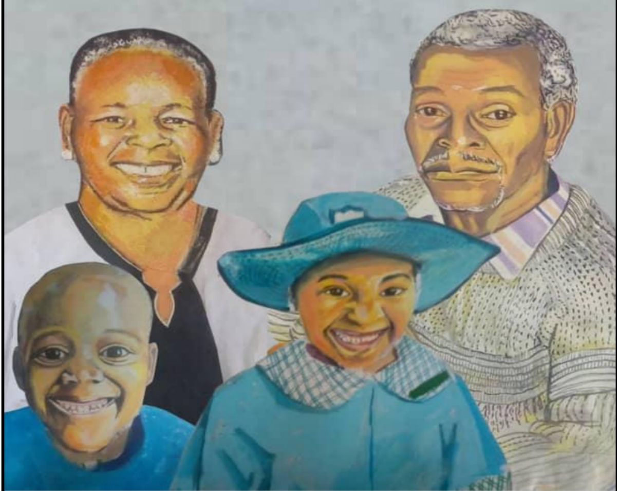
Umakhulu, Utat'omkhulu nabazukulwana Grandmother, grandfather and grandchildren