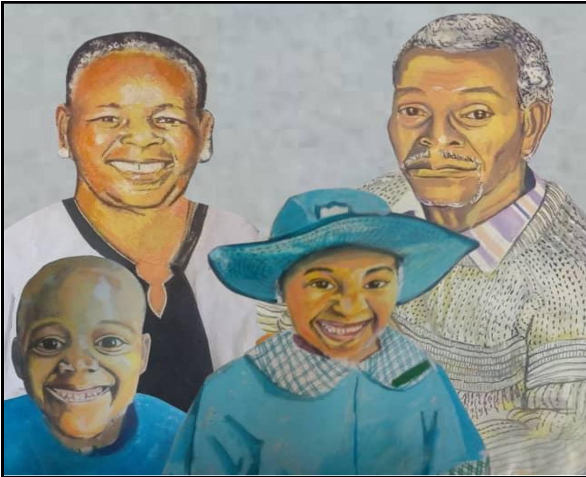
Jajja mwaami/omusajja,jjaja mukyaala/omukazi na abazukulu Grandmother, grandfather and grandchildren