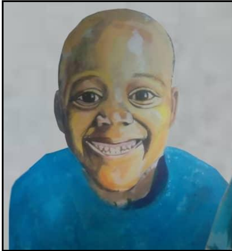
Bona umfana-Look at the boy